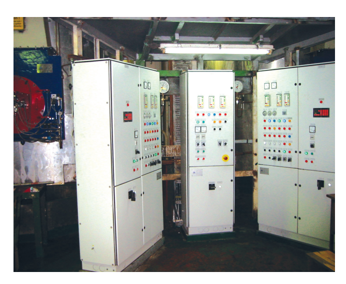
Alfa Laval Aalborg replaced the burner and control system on board Vietsov-petro's FPSO "Ba Vi". A KBSA™ steam atomizing burner was installed on the existing boiler.

In case of upgrading to a more advanced control system, Alfa Laval Aalborg provides technical advice on the various solutions available in the market.