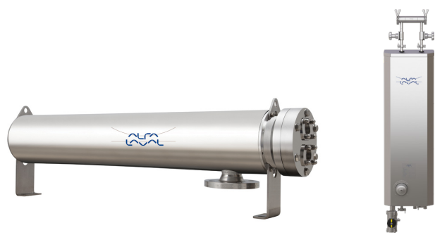
Alfa Laval Pharma-line shell & tube and point-of-use module

Heat exchangers: Both tubular and plate-type heat exchangers can be used in the distribution loop for heating and cooling. Compared to plate heat exchangers, shell-and-tube heat exchangers often have higher initial investment costs as well as higher energy usage and thereby higher operating costs due to high-pressure drops. Other maintenance costs for shell-and-tube heat exchangers, however, are generally lower than those of plate heat exchangers.