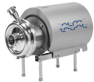
Alfa Laval LKH UltraPure

Pumps: Because the circulation pump is in constant use, it is important to select a robust, reliable and energy-efficient pump. Be sure to size the pump correctly; oversizing the pump wastes energy.