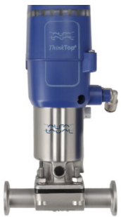
Alfa Laval DV-ST designed to reduce pressure drop, and without dead legs